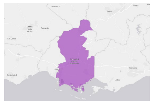
Figure 2. A map of the Guayama-Salinas Nonattainment Area, shown in purple.

Location: Inter American University, Guayama Campus at Bo. Machete, Carr. 744, Km 1.2 Guayama, PR 00784