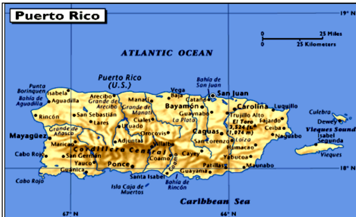
Figure 1. Puerto Rico map.